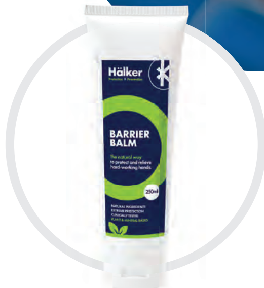
V40-HK686 Barrier Balm - 250ml Tube

Small enough to tuck in a glovebox or in a workbag, individual Barrier Balm tubes are an ideal way to keep protected wherever you are working.