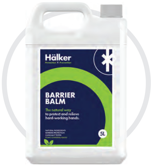
V40-HK685 Barrier Balm - 5L Jerry Can

Ideal for refilling mobile and static skin care station dispensers, this bulk sized jerry can will help ensure the continuity of your workplace skincare strategy, with hand protection whether you are in the workplace or on the move.